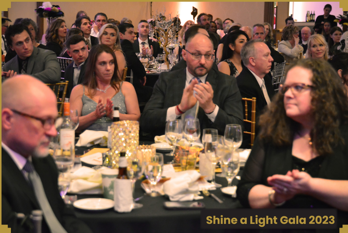
Shine a Light Gala 2023

Of course, we certainly appreciate you sponsoring, placing an ad in the program, and donating items for our live & silent auctions, but in addition to that... we really want YOU there!